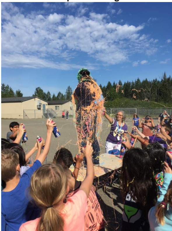
Final Box Tops contest!